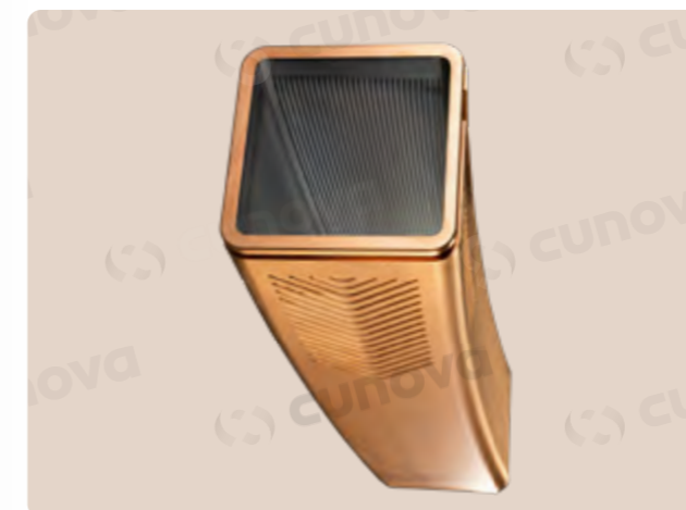
WAVE® mould tube with CV Cooling Design