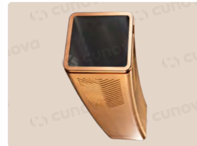
Standard mould tube (flat inside) with CV Cooling Design

Lower hot face temperatures reduce the risk of an attack by harmful elements and early coating damage. Furthermore, the better cooling conditions increase the shell growth, providing a stiffer steel shell as basis for an increase in casting speed.